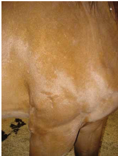
12 FES Treatments Lateral View