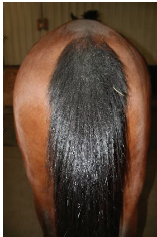
4/23 Pre-FES Treatments

SUMMARY: Upon examination Joe was Grade 3/5 lame in both hind legs. Observation during trotting showed a locked hip positioning the torso to the left while tracking in either direction or straight. Palpation to the lumbar/sacral region produced no rotation and a “drop” in the lumbar area to pressure on the right side of the spine. The right pelvis was low and rolled forward in its position relative to the left. Observation of the dorsal spine showed a “S” shape lateral curve pushing the torso to the left. Left scapula was pushed forward and was higher in position relative to right scapula.