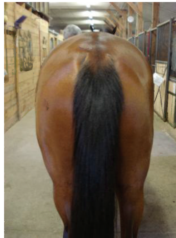
6/26 After 7 FES Treatments