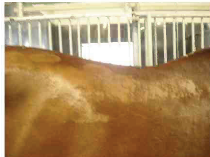
July 3 After 4 FES treatments