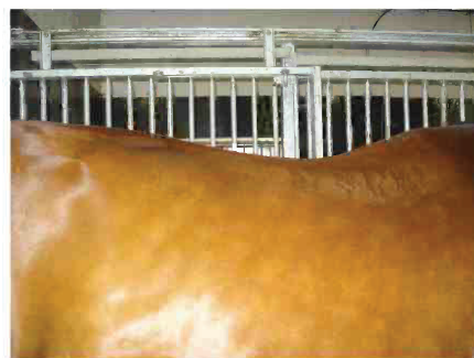
July 4 After 7 FES treatments