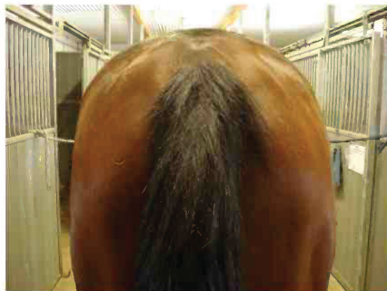
July 3 After 4 FES treatments