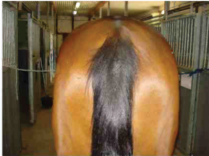
July 2 Pre FES treatment

SUMMARY: Upon examination the horse exhibited severe spasticity from T10 to sacrum, spasticity was more pronounced on the right. The horse was extremely sensitive to palpation and required tranquilizers for examination. The spasticity was noticeably improved after 4 treatments, (2 FES T18-S3; 1 FES T10-L4; 1 FES gluteals). As the treatments continued, the horse showed reduced spasticity and was more comfortable. After the 1 st treatment, the horse did not require sedation.