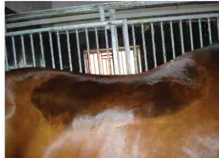
July 2 Pre FES treatment