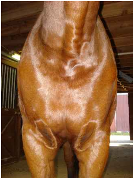
Pre-FES Treatments 11/22

SUMMARY: Upon examination the gelding showed distinct atrophy of the right shoulder muscles, specifically the triceps. The horse was grade 4 lame in the right front and had previous problems with the ligaments of the right front coffin confirmed with MRI. At the time of examination, the ligament problem was resolved based on MRI images, but the lameness continued. Injections of the coffin and fetlock did not resolve the lameness. 6 FES treatments were given over a period of 3 months. The treatments were given in sets of 3, with 6 weeks between sets. During the first set for treatments, 2 FES treatments were given to the triceps and 1 FES treatment to the forearm all on the right side of the horse. Riding after the 3 treatments showed a reduction to Grade 1 lameness. Six weeks later the second set of treatments were given, 2 treatments were to the triceps and 1 treatment to the topline between T10-L3. Riding after the second set of treatments showed no lameness. Follow up treatments every 6-8 weeks have been continued with no further lameness.