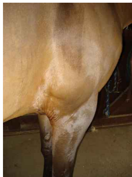
6 FES Treatments 2/17