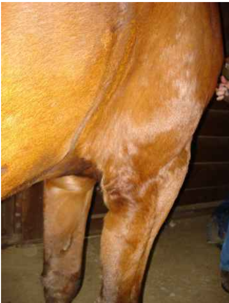
Pre FES Treatments 11/22